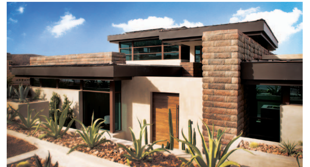
WITH ITS ULTRA-EFFICIENT ENVELOPE, THE NEW AMERICAN HOME SURPASSES NET ZERO, GENERATING MORE ENERGY THAN IT ACTUALLY NEEDS.