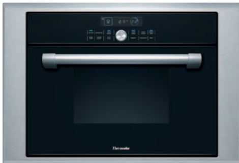
THERMADOR'S MASTERPIECE SERIES STEAM AND CONVECTION OVEN ALLOWS TWO MODES OF COOKING AT THE SAME TIME.