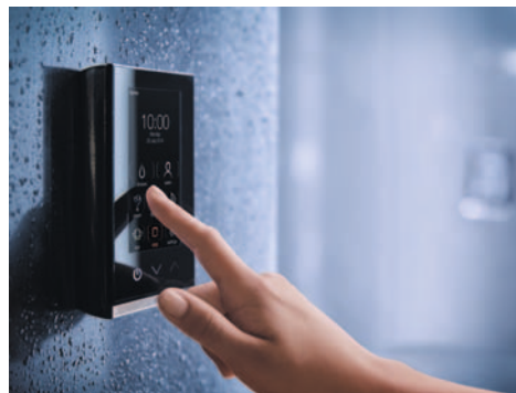
KOHLER'S MOST ADVANCED SHOWER SYSTEM TO DATE, THE DTV+, ENABLES TOUCHPAD CONTROL OF STEAM, WATER, LIGHT, AND SOUND.