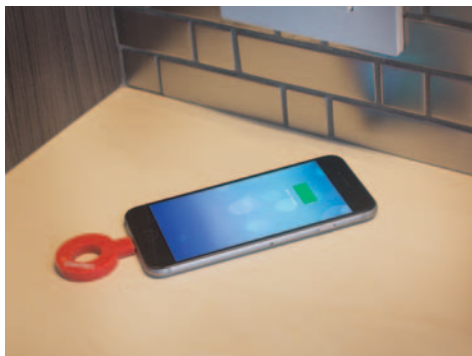
DUPONT'S CHARGING SURFACE HAS A TRANSMITTER INSTALLED BENEATH THE COUNTERTOP SURFACING, HELPING ELIMINATE CORDS, CHARGERS, AND CLUTTER.