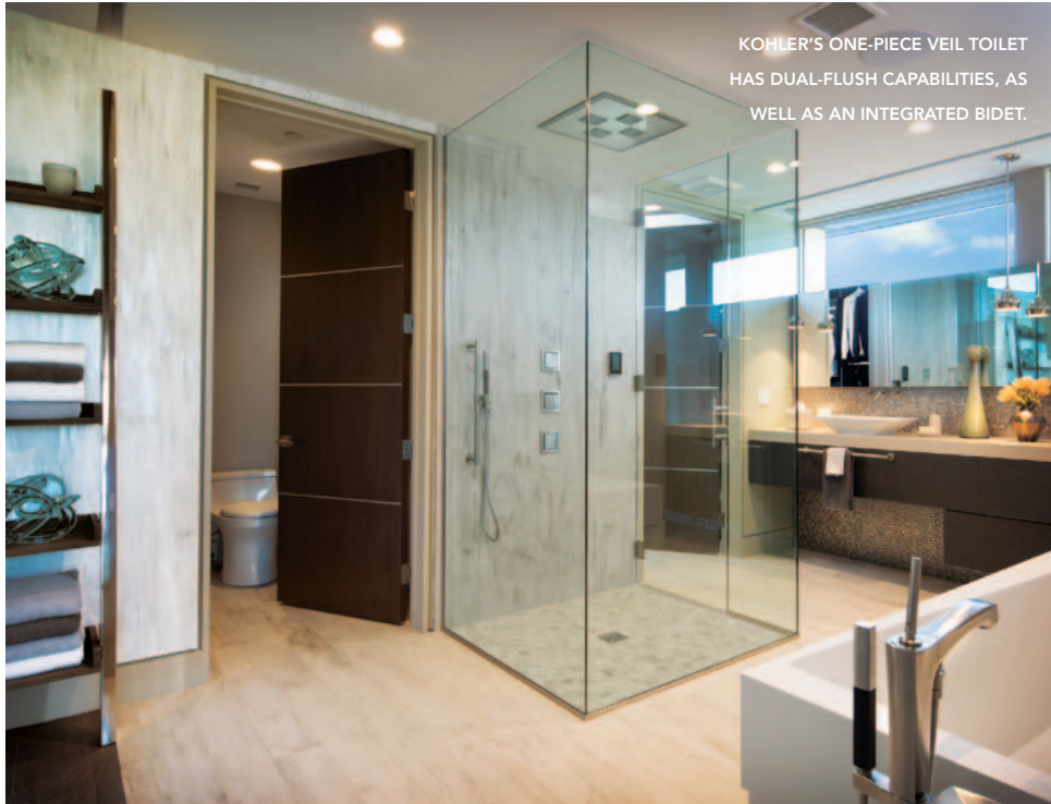
KOHLER'S ONE-PIECE VEIL TOILET HAS DUAL-FLUSH CAPABILITIES, AS WELL AS AN INTEGRATED BIDET.