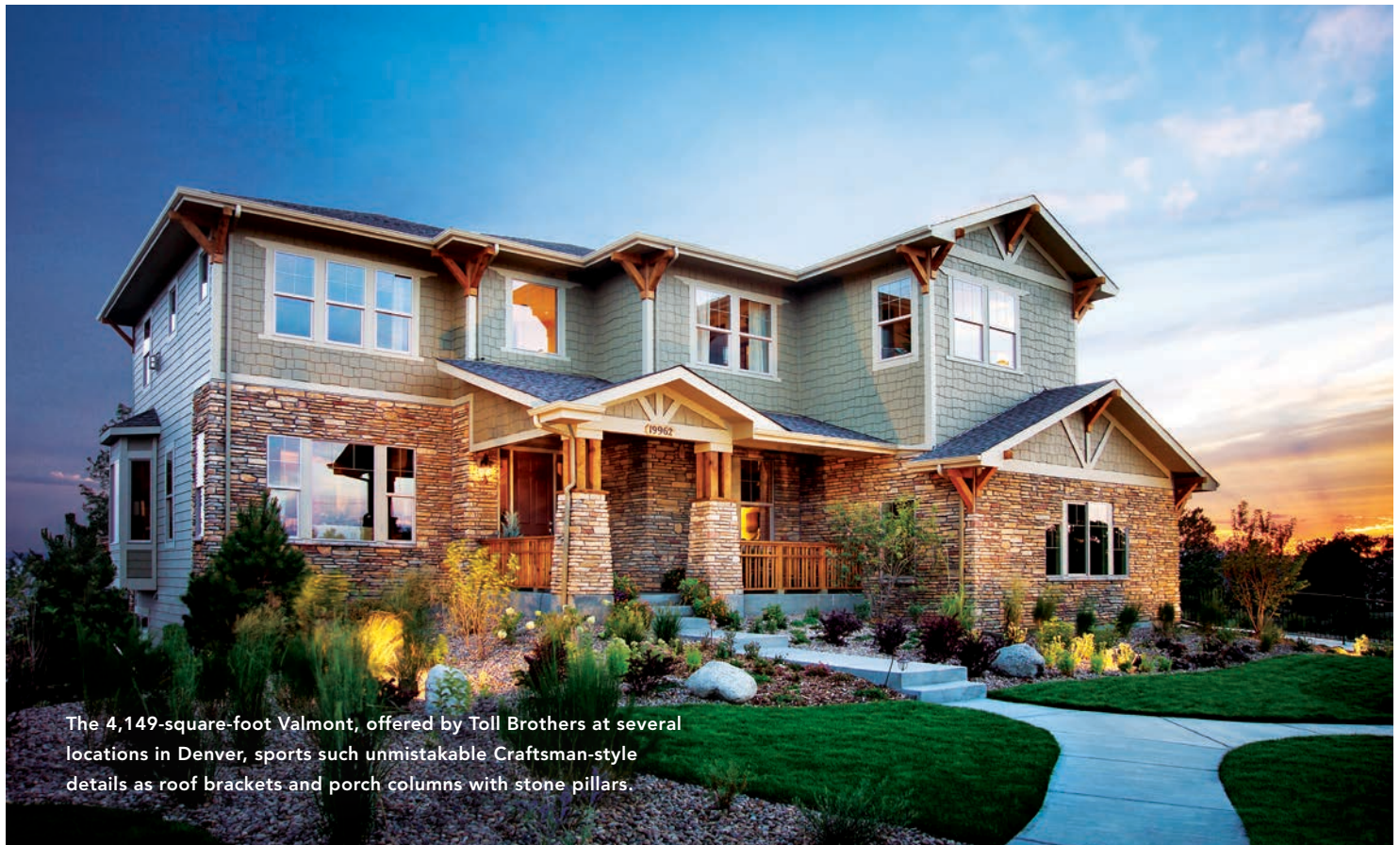
The 4,149-square-foot Valmont, offered by Toll Brothers at several locations in Denver, sports such unmistakable Craftsman-style details as roof brackets and porch columns with stone pillars.