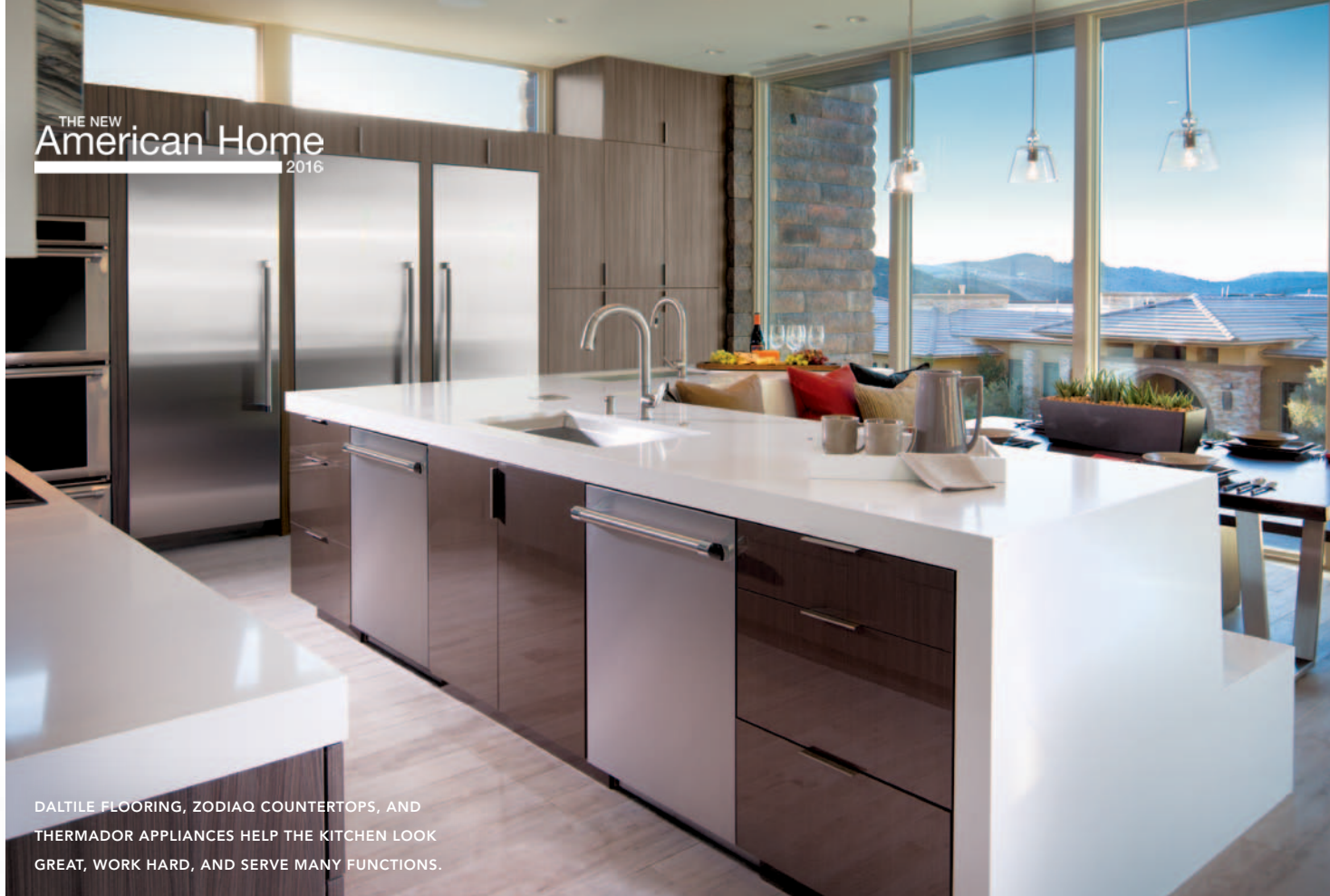
DALTILE FLOORING, ZODIAQ COUNTERTOPS, AND THERMADOR APPLIANCES HELP THE KITCHEN LOOK GREAT, WORK HARD, AND SERVE MANY FUNCTIONS.

The kitchen layout is anchored by a vast central island with ample prep space for big meals and multiple cooks, a second undermount sink, and pop-up electrical outlets. The outside face of the island cascades into a built-in breakfast nook, which offers a more intimate scale—the perfect place for everyday meals. Down the hall is the more formal two-story dining room.