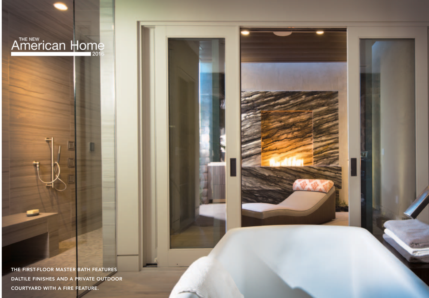
THE FIRST-FLOOR MASTER BATH FEATURES DAL TILE FINISHES AND A PRIVATE OUTDOOR COURTYARD WITH A FIRE FEATURE.

features that promote relaxation. A Kohler Aliento freestanding tub offers a soothing soak; the Loure tub filler delivers a sheet of water. Calming luxury continues in the custom shower, which has multiple body sprays and a window overlooking a garden. “A lot of times, bathrooms and closets are pretty dark, but when you introduce windows it makes a difference in the way those spaces feel,” Anderson says. A wall of glass adjacent to the tub connects the bath to a private patio. High windows in the bath and closet flood private spaces with light.