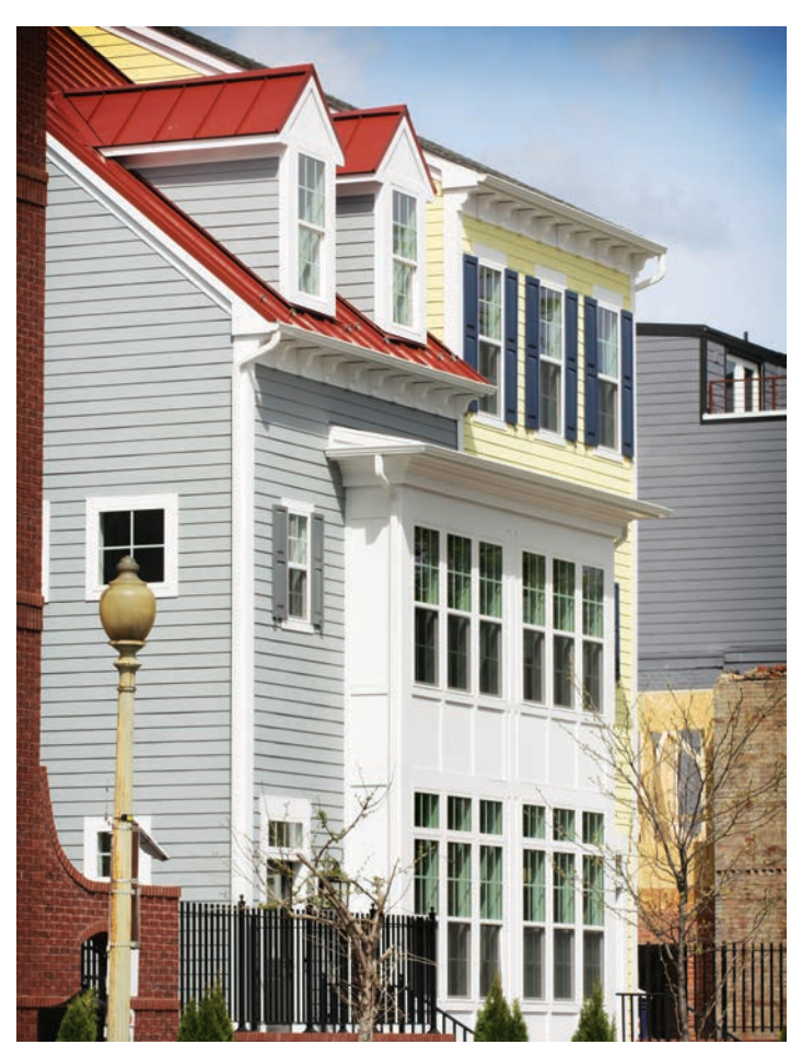
Washington, D.C., developer OPaL attracts bookenders by leveraging the urban, transit-friendly location of Morton Street Mews.

What's clear is that old ideas offer new answers. Once-traditional setups that have fallen out of favor—higher density, walkability, accessory dwellings, bungalow courts, and shared amenities—offer relevant solutions and appeal to groups that bookend the buyer spectrum. Old ideas made new again may hold a key to delivering practical and desirable homes to two burgeoning buyer groups that share more in common than we might have imagined. PB